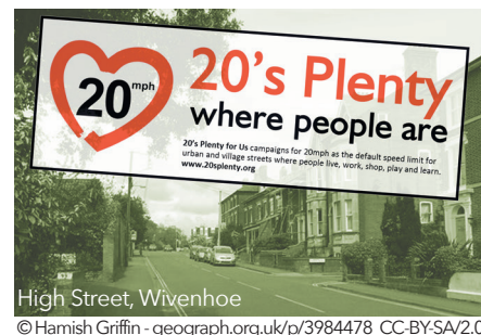
High Street, Wivenhoe