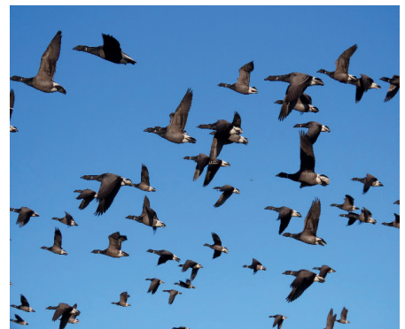
Brent Geese